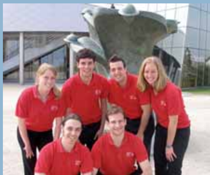
Bilingual Canadian guides offer a warm welcome.